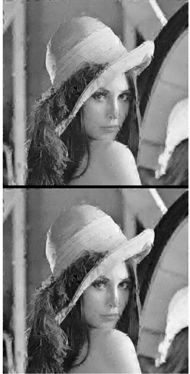
Figure 7: The raw entire Lenna image. It is generated from the corrected s1-s1 subband and the raw s1-d1, d1-s1, and d1-d1 subbands (top). The final corrected image with a PSNR of 27.54 dB (bottom).