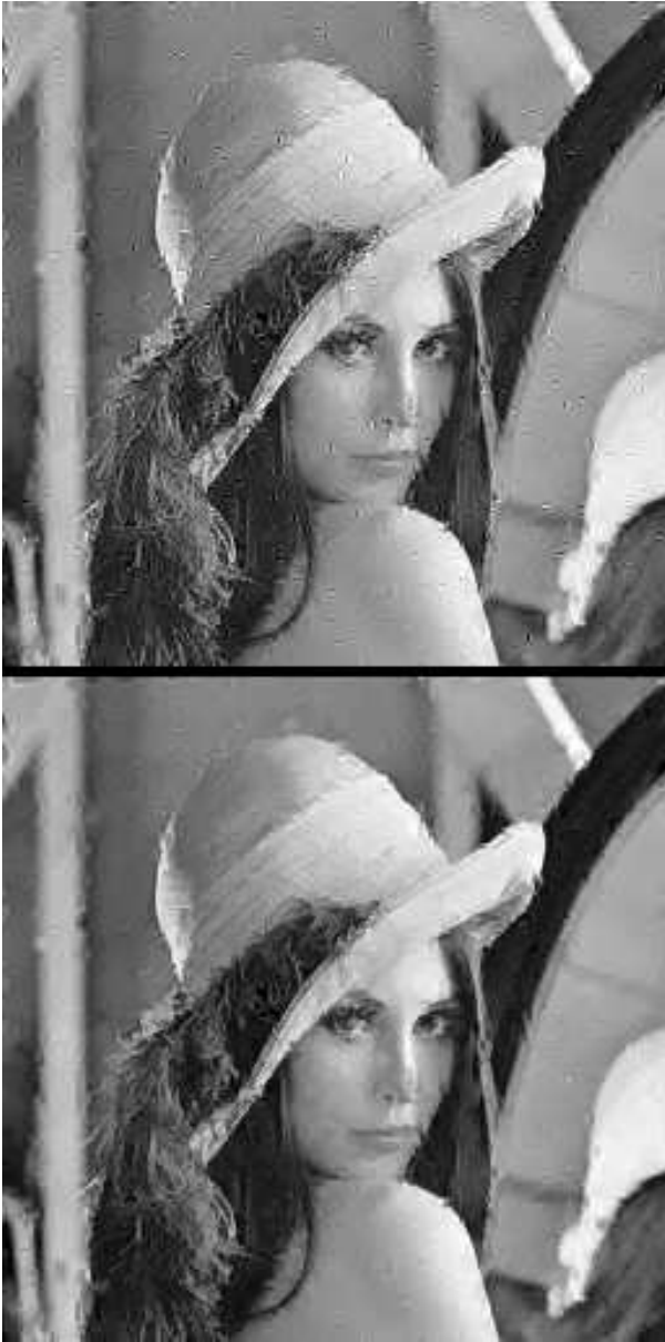
Figure 6: The raw s1-s1 subband of the Lenna image magnified by a factor of 2. It is generated from the corrected s2-s2 subband and the raw s1-d1, d1-s1, and d1-d1 subbands (top). The corrected s1-s1 subband (bottom).