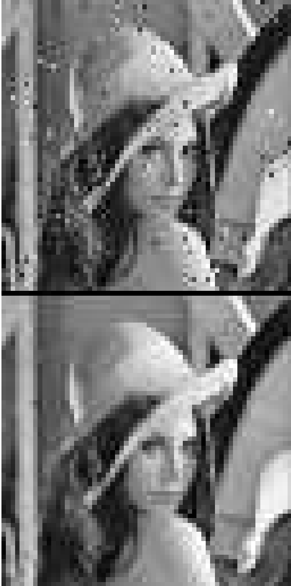
Figure 4: The received s_3 - s_3 subband of the Lenna image magnified by a factor of 8 (top). The corrected s_3 - s_3 subband (bottom).