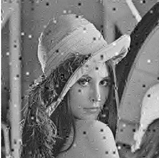
Figure 3: A reconstruction of Lenna without any correction. The PSNR is 23.74 dB.

An example of the progression of our algorithm as it corrects an image is presented in Figures 4, 5, and 6. The final reconstructed image is presented in Figure 7. Compare it to the image in Figure 3 when no correction is used.