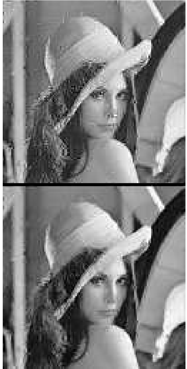
Figure 5: The raw s_2 - s_2 subband of the Lenna image magnified by a factor of 4. It is generated from the corrected s_3 - s_3 subband and the raw s_3 - d_3 , d_3 - s_3 , and d_3 - d_3 subbands (top). The corrected s_2 - s_2 subband (bottom).